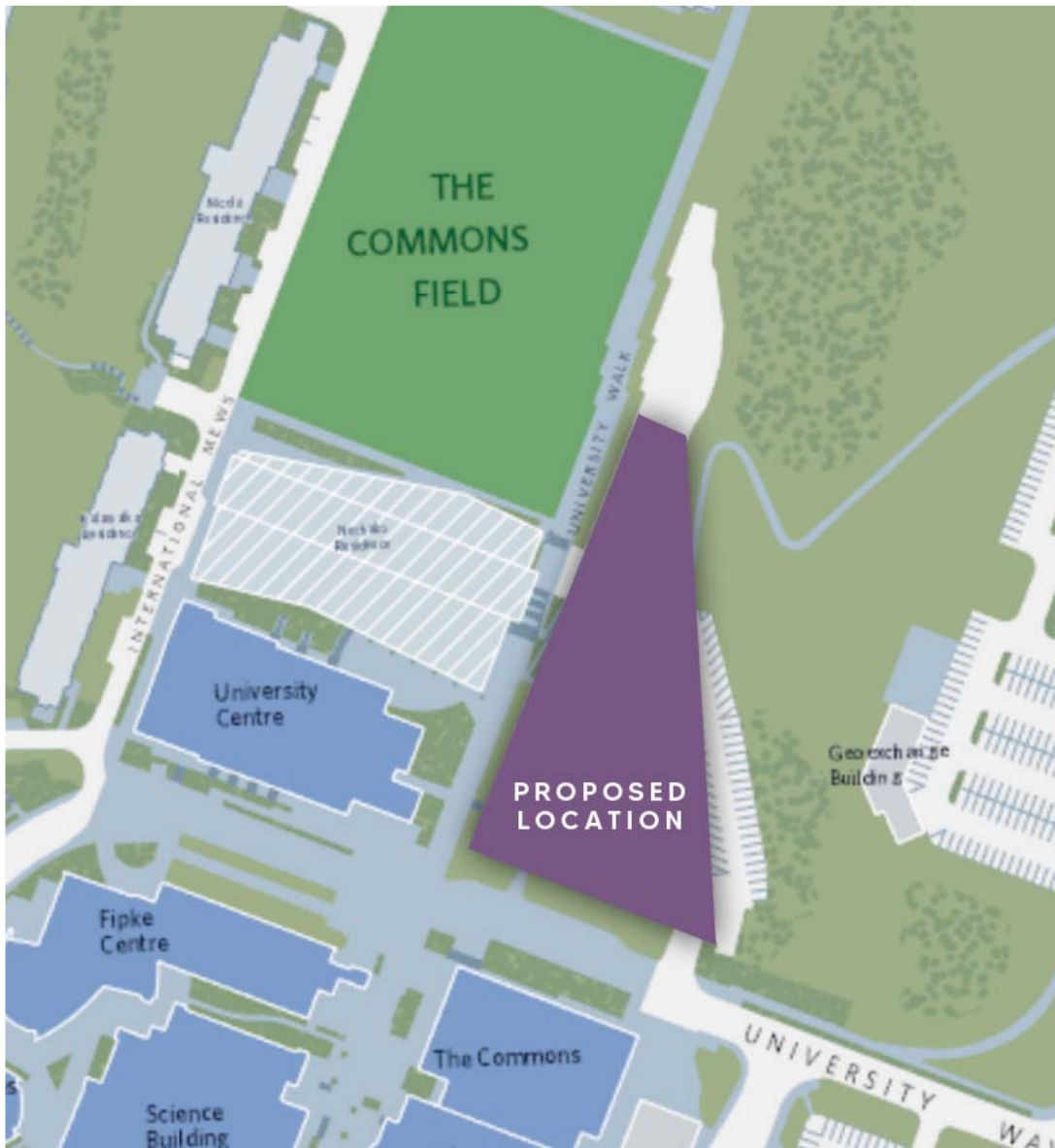
PROPOSED LOCATION UBC OKANAGAN

The Forum would be a central hub of campus, being built on top of what is currently parking lot F. This building would be constructed sustainably to LEED certifications, and would be the result of intensive consultation of the student body to ensure every member has the ability to contribute directly to its development.