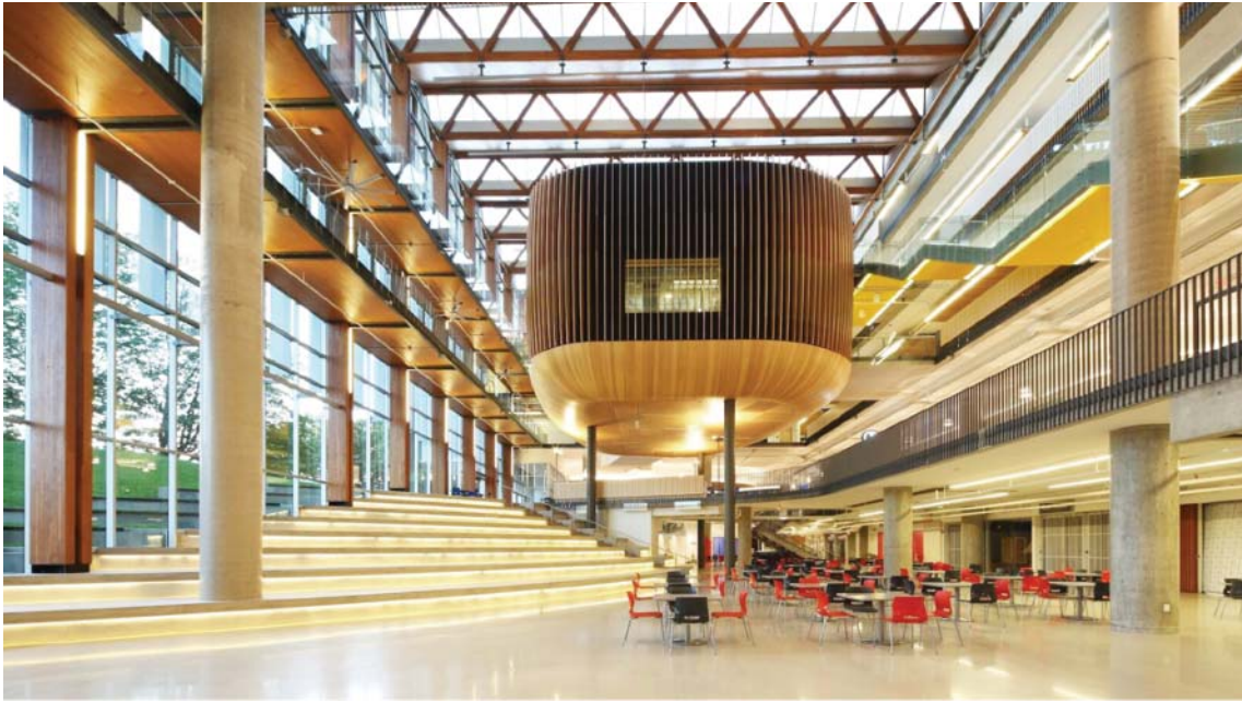
AMS STUDENT NEST INTERIOR UBC VANCOUVER