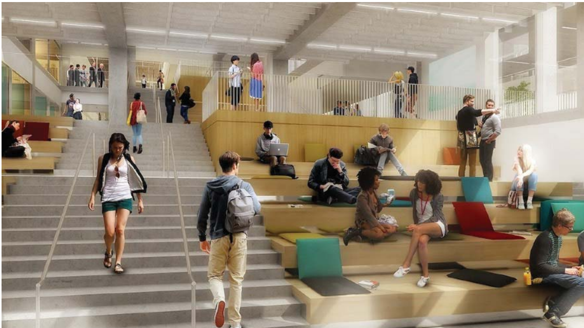
SFSS BUILDING INTERIOR SIMON FRASER UNIVERSITY