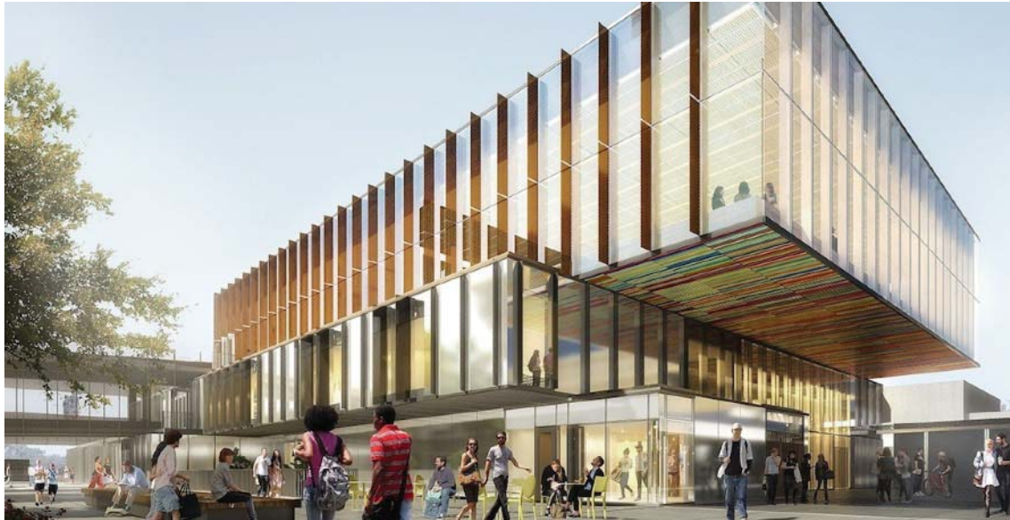
SFSS BUILDING SIMON FRASER UNIVERSITY