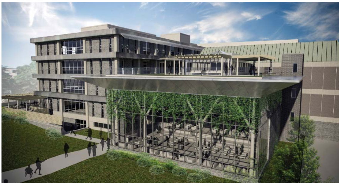
STUDENT UNION BUILDING DALHOUSIE UNIVERSITY